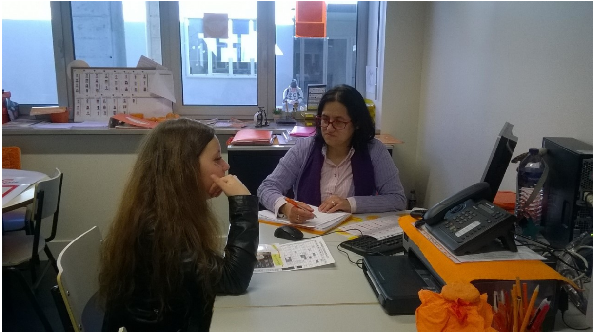
Figure 1: A mediation session

Notes: An illustration of a one-to-one mediation session in a participating school.