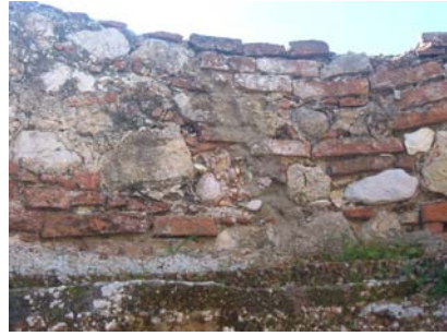
Figs. 8 and 9 – Two examples of Roman ancient interventions.

Those interventions could eventually be contemporaneous since the materials used have much in common (the chosen materials are characterized for being a mortar with the same characteristics). However this introduction of new materials resembles to be a purely functional intervention, having the initial structures lost its primitive aesthetic enchantment.