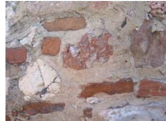
Figs.10 and 11- Reconstruction and copertine (70's)