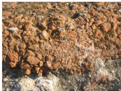
Fig. 6 and 7 – Cistern render ( frigidarium ) and detail of the opus signinum