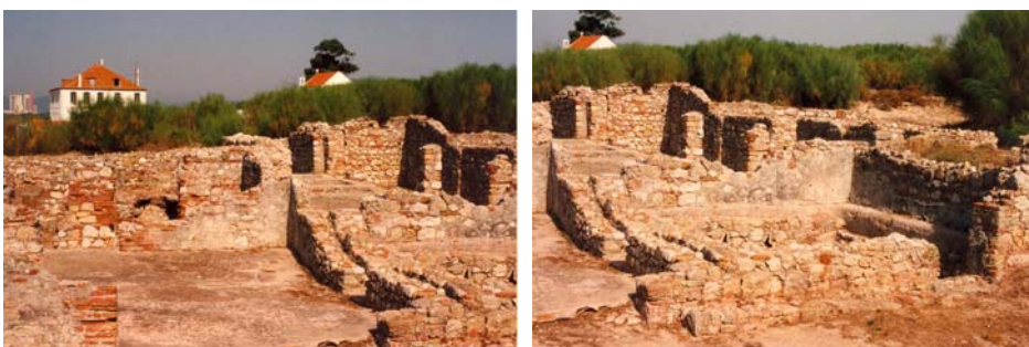
Figs. 1 and 2 – General view of the Roman Baths area

According to Etienne et al [2], it is not possible to present a chronological development, but only describe this architectural complex, presenting the diverse transformations suffered from ancient times.