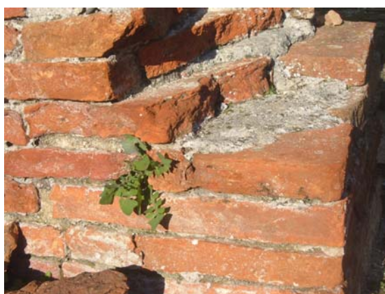
Figs. 4 and 5 - Caldarium : opus incertum and opus mixtum wall and a detail of an opus testaceum pillar