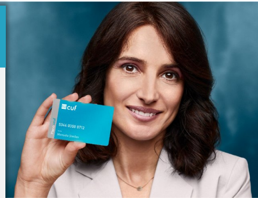
Figure 14 – *Prototype Pack based on membership medicine competitor benchmark, on current Plano CUF + pricing strategy and on willingness to pay of the studied sample