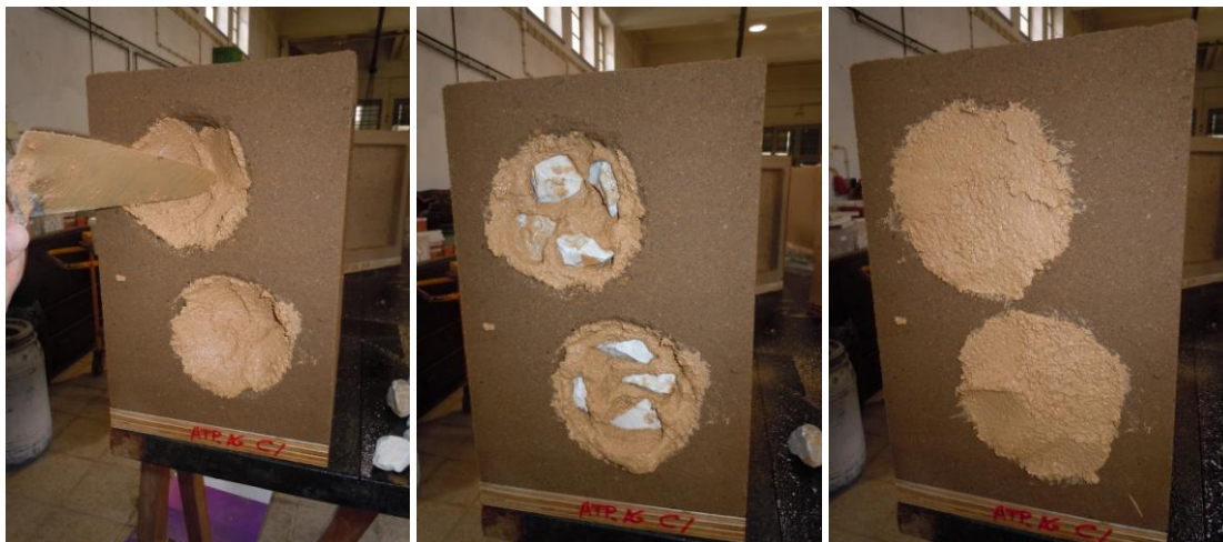
Figure 3: Application of the mortar MRE on a standard deep voids defect of the Av rammed earth

Immediately after application of the mortar begins the initial drying shrinkage, which is inhibited by adhesion to the support. This shrinkage leads to the development of shear stresses in the plane of contact of the mortar with the support. This can cause the detachment and tensile stresses in the mortar which can cause cracking. Because of this it was necessary to repoint some cracks. Cracks appeared in the mortars approximately 2 to 3 hours after application, on both types of standard defects and on both types of deep holes (with and without coarse gravel). The repointing was undertaken 4 hours after application.