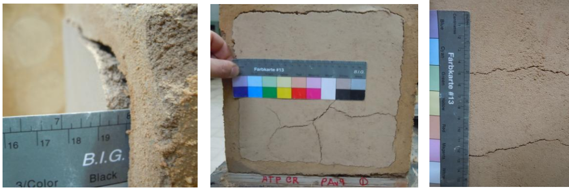
Figure 5: Mortar MRE_NC15 applied in block BA v on standard superficial defect: left, detachment of the mortar; center, cracks; and right, detail of large cracks