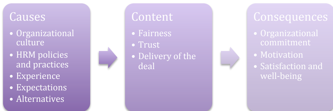
Figure II - A model of the psychological contract (Armstrong, 2009)

The second type of contract defining the employment relationship is the psychological contract, which is implied rather than stated. A psychological contract can be defined as the assumptions, beliefs, and expectations held between the employee and the employer/organization about the nature and function of the relationship between them (Clegg, Kornberger, Pitsis, 2011). It is an experiential-based perception of what people see and report happening to them as they make sense of their environment (Bowen & Ostroff, 2004). Aspects of the employment relationship covered by the psychological contract include the employee's point of view on how they are treated in terms of fairness, equity and consistency, security of employment, career expectations, the opportunity to develop skills, and the kinds of behaviours that management expects, supports and rewards (Armstrong, 2009). A model of the psychological contract (Armstrong, 2009) is illustrated in Figure II.