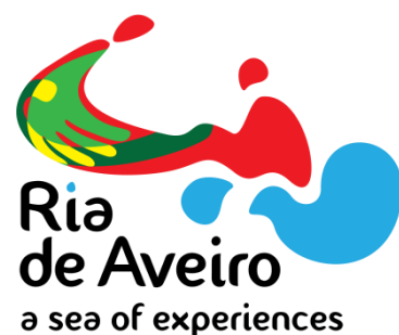
Picture 5 - Final Logo