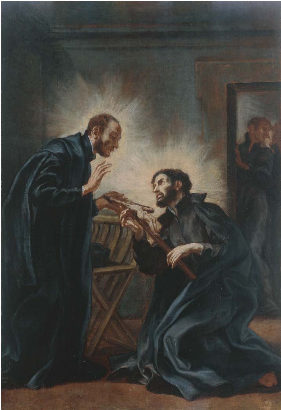
Giovanni Battista Gaulli (1639-1709) Saint Ignatius of Loyola and Saint Francis Xavier Oil on canvas, ca. 1675-1685 Toulouse, Musée des Augustins. Musée des Beaux-Arts de Toulouse, Inv. RO 417