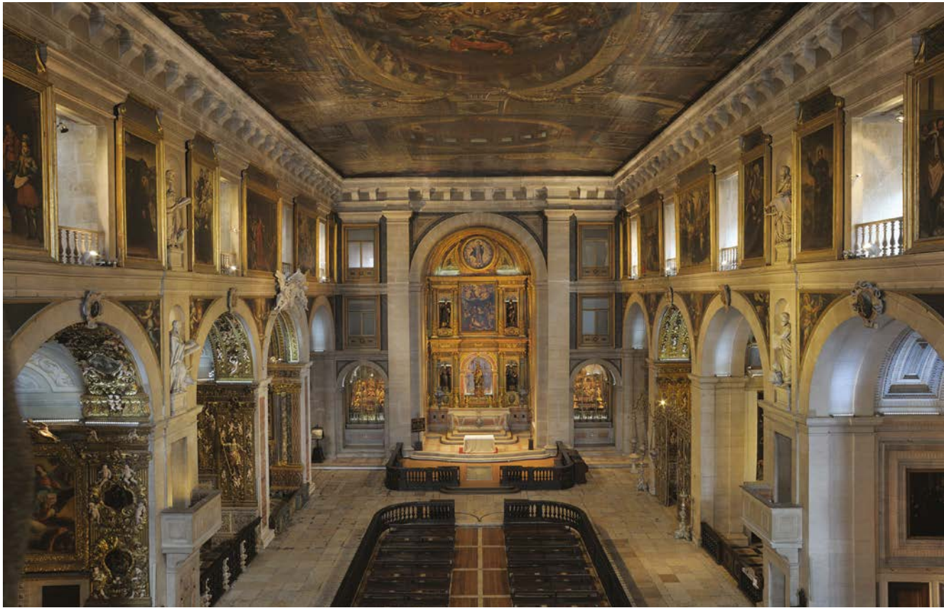
View of the Church of São Roque in Lisbon Lisbon, Santa Casa da Misericórdia

by the Society of Jesus. Four ambassadors, from Africa, Asia, the Americas, and Europe, transported in four richly decorated brigantines, took part in the festival at São Roque to praise the new Blessed. Four triumphal floats left from Santo Antão-o-Novo heading for Terreiro do Paço, accompanied by a procession of spear carriers, who were joined by yet other representations of brigantines with allegories of the Americas, Africa, Asia, and Europe 4 .