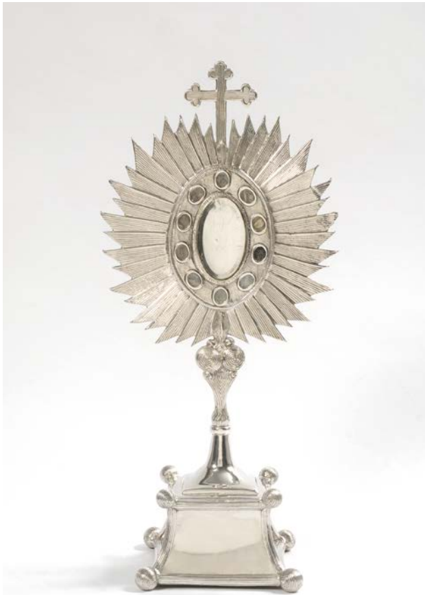
Reliquary-Monstrance Silver and glass, 17th century Lisbon, Museu de São Roque, Santa Casa da Misericórdia, Inv. RL. 60

have their small scapulars made in black taffeta, to wear, as they usually do, around their necks 67 .