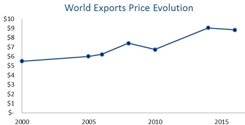
Exhibit 3 Average Export Price Evolution 2000-2016

Source: World Footwear Yearbook 2011 & 2017