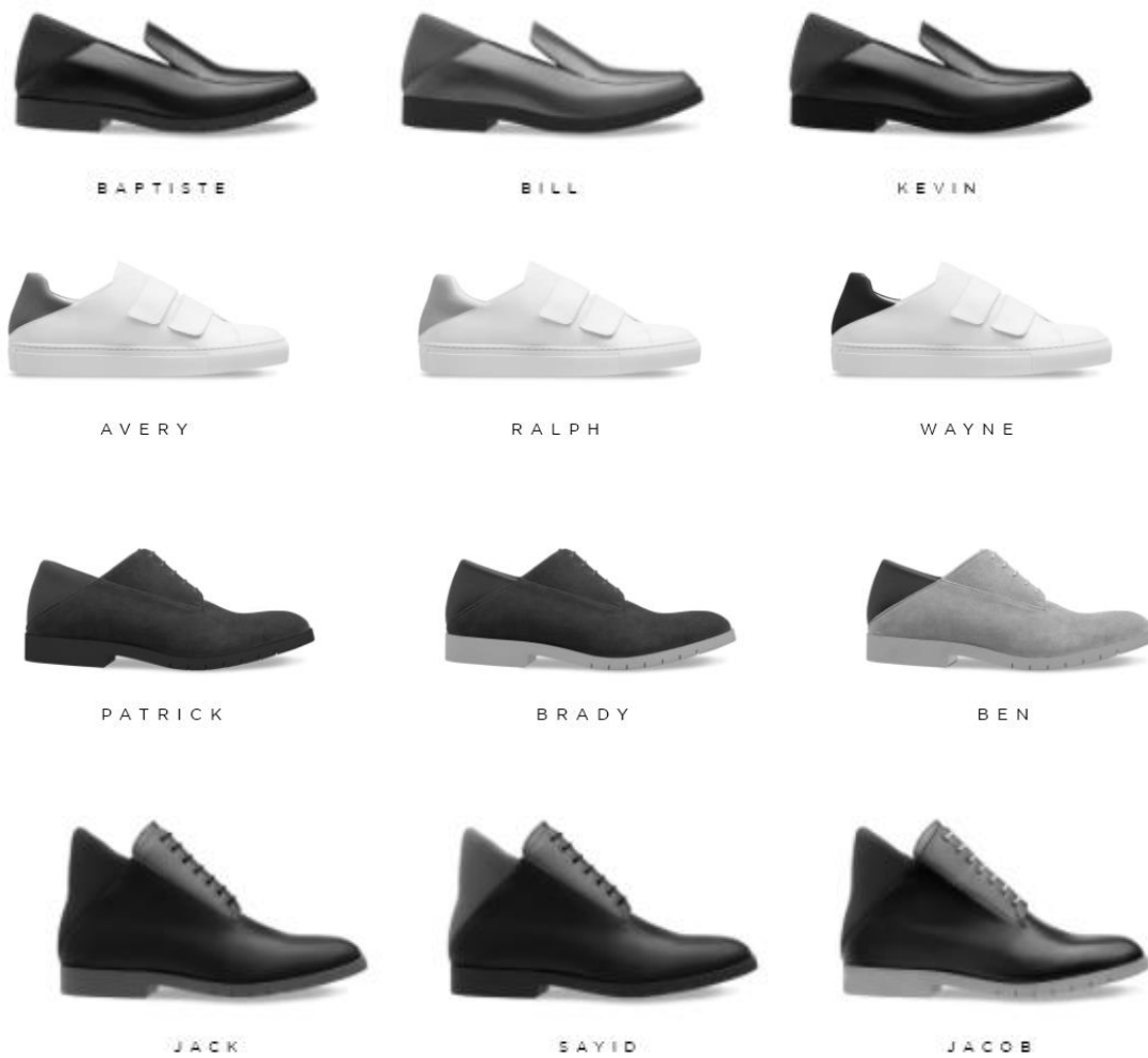
Exhibit 5 Freakloset models: Counter’s neoprene composition