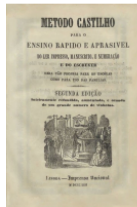
Title page, "Method for Learning How to Read"

Mourão-Ferreira, David; 1976. António Feliciano de Castilho, poeta (Lisbon: Academia das Ciências de Lisboa) ["A.F. de C., poet"]