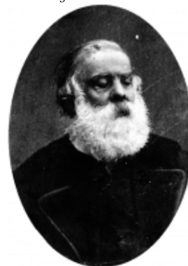
António Feliciano de Castilho (1850)