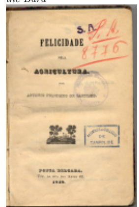
Title page, “Happiness through Farming”