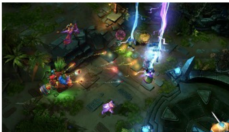
Fig.1 – MOBA game example

League of Legends is a MOBA game (Fig.1), meaning a Multiplayer Online Battle Arena – “also known as action real-time strategy (ARTS), is a subgenre of strategy video games that originated as a subgenre of real-time strategy, in which a player controls a single character in a team who compete versus another team of players”. The competitors are MMO’s - Massively Multiplayer Online Game (Fig.2), “online game with large numbers of players, typically from hundreds to thousands, on the same server” - World of Warcraft is an example of this genre - and RPG’s - Role Playing Game (Fig.2)- “game in which players assume the roles of characters in a fictional setting” - For example Dungeons and Dragons. - although they usually come together.