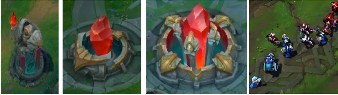
Fig.6 – turret, inhibitor, nexus and minions respectively

When playing the game there are several terms that one might take into account: