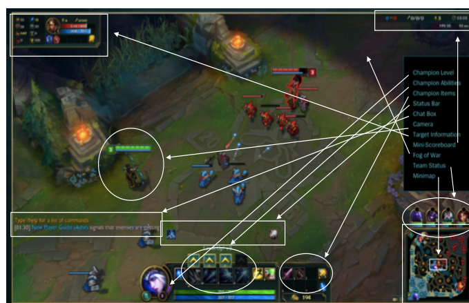
Fig.5 – Usual aspect of the gameplay

To win the game, teams need to destroy several structures of one of three types: turrets, inhibitors and finally the nexus. These are also protected and attacked by minions and both teams have to help them in achieving victory.