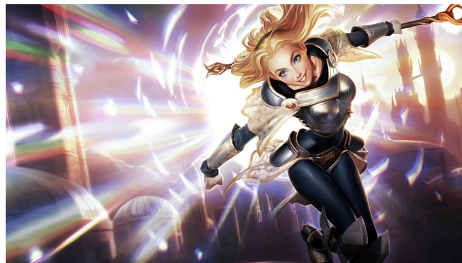
Fig.3 – Lux usual appearance

Moreover, Fig.4 represents an example of a champion, named Lux. She has a lot of different skins (Fig.5) - unique new appearances that change the look of their attacks.