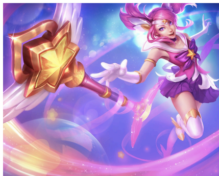
Fig.4 – Lux skin examples