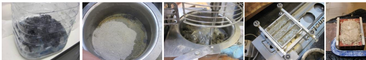
Figure 2. Mortar production

The mixture of the mortar components was mechanical and always identical between the mortars with the same type of binder (Figure 2). For air-lime mortars the water was added in the mechanical mortar mixer tank, followed by the air-lime and the sands (previously hand homogenized). The mechanical mixer worked for 30 seconds at low speed, the material at the border and bottom of the tank was scraped and the mixer worked for another 3 minutes. The procedure was based on EN 1015-2 [6] but the period of mixture was enlarged because, in previous works [7], the one defined in the standards was considered inadequate for air-lime mortars. For cement mortars the time defined in the standards was followed. With each mortar several samples were produced. The mortar samples were mechanically compacted in two layers inside prismatic metallic moulds with 40 x 40 x 160 mm. Each mortar was applied over two ceramic bricks, falling from a defined height, in order to standardize the energy of application of the mortar over the brick (Figure 2) and regularized as a render.