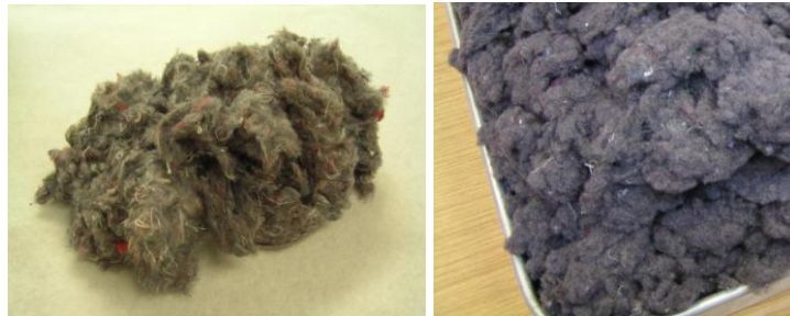
a.) waste fibrous materials. b.) waste fibers.

The waste fibers used in the present research work derive from waste fibrous materials collected from textile industries in the outskirts of Minho area, in the northern part of Portugal. The fiber mass consists of many unknown fibers, since it was collected from several textile industries producing a various range of textile qualities and consequently using many different fiber materials and fiber/fabric treatments (Figure 1. a)). The collected waste fibrous material was used for the production of nonwovens and the waste fibers used in this research work are manufacturing wastes of the nonwoven manufacturing process (Figure 1. b)) - microfibers.