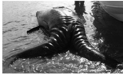
Fig. 5: The dead Gray Whale conjoined twins had two heads and two tails; the latter may resemble the two tails of double mermaids.

resemble the double tail of the mermaids (see Fig. 6 and Fig. 7).