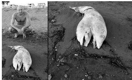
Fig. 4: Rare case of conjoined twin dolphins in Turkey (August 5, 2014); a case of polycephaly (two heads) in dolphins.

The same happened with the two-headed Bottlenose Dolphin ( Tursiops truncatus ) calves found off Istanbul, Turkey (August 2014); the event was spread out, and photographs of the strange happening were disseminated. However, on the other contrary to others, this specimen was collected and kept for study.