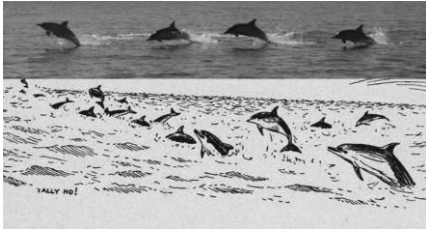
Fig. 1: Dolphins porpoising in a line, in a possible visual interpretation of a sea serpent at the surface.

iconographic descriptions may have been the result of misinterpreted encounters with local (but rare) or exotic/tropical marine mammals, or even misconceptions of observations of real elements and events from the aquatic environments.