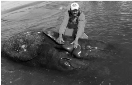
Fig. 3: Scientists in Mexico's Laguna Ojo de Liebre, discovered the dead grey whale calves in January 2014, believed to have been miscarried as a result of their disability.

(and in the paper, they go on by giving the description). The awkwardness of such encounters may result in this attitude of returning the 'monster' back to his place of origin.