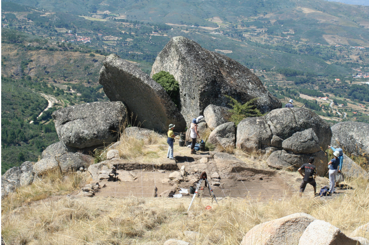
Figure 15.3. Soida (Celorico da Beira). Archaeological site from the tenth century, Estrela Mountain.