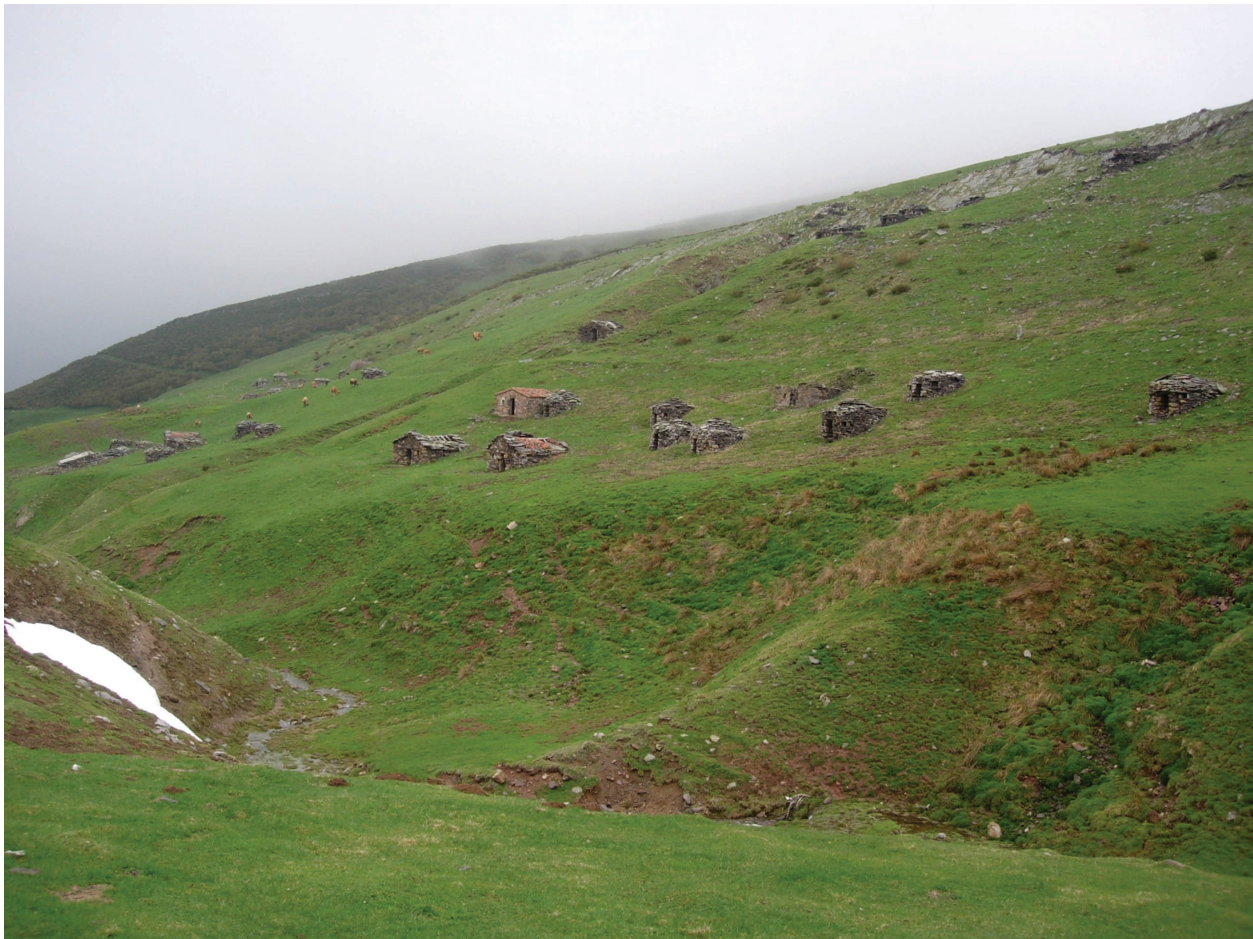
Figure 15.2. Braña La Mesa (Asturias, Spain). A braña used in short-distance transhumance situated in the highest pastures of the Cantabrian Mountains.

In addition to archaeological investigation in the Cantabrian Mountains, recent bioarchaeological research has unveiled evidence of major deforestation which appears to have started in Roman times. This process intensified in the fifth century and continued until the tenth century, leaving a largely treeless landscape with large grazing areas. In some cases, this was paired with intensive livestock breeding near the villages. In others, it appears to have been coupled with