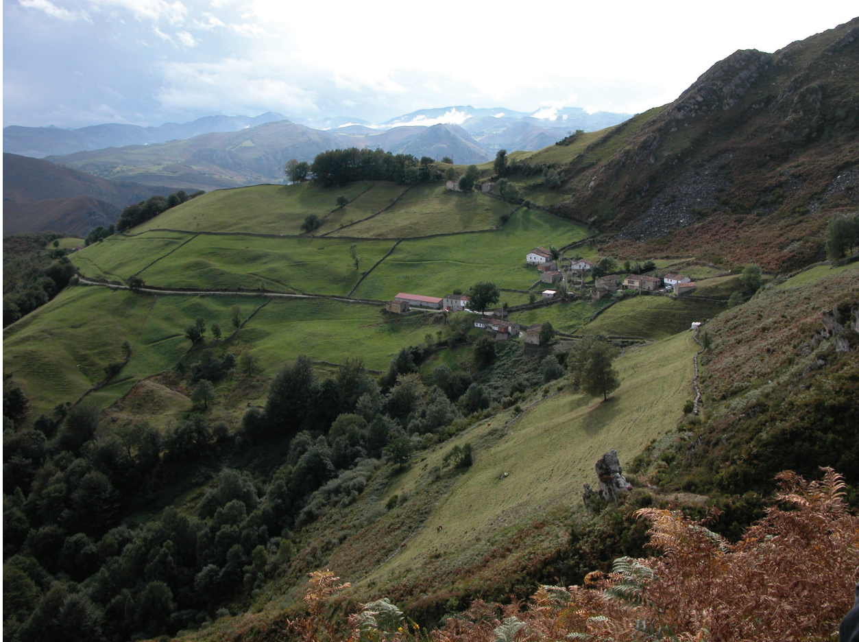
Figure 15.4. Moudreiros (Asturias, Spain). A winter vaqueiro village or braña de invierno.