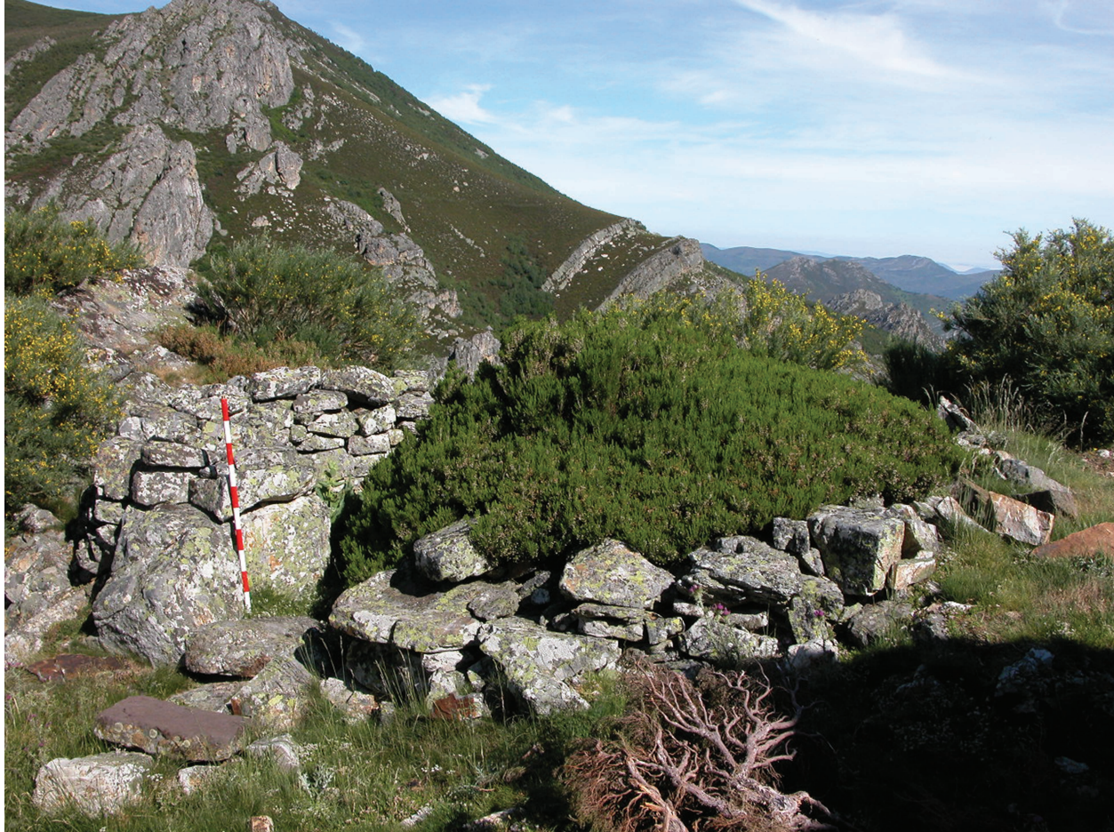
Figure 15.6. A chozo for Mesta herds from the Cantabrian Mountains