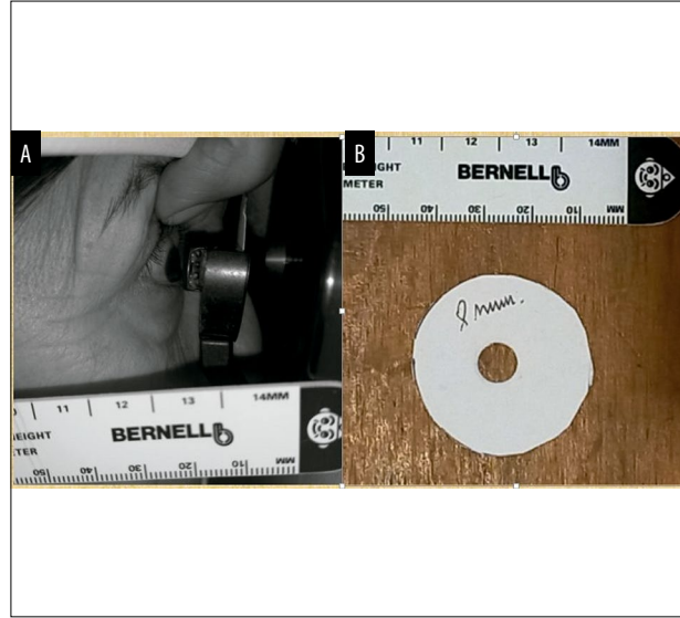
Figure 2. A) Subject's 12mm vertex distance with the opaque frame with an 8 mm hole located in the farthest slot of the perimeter. B) Round whiteboard opaque frame with an 8 mm hole.

defocus 10 . These findings align with previous experiments of Earl Smith in 2005 showing that foveal ablation with laser beams did not alter much the emmetropization mechanisms in the monkey model 11-12 . Additionally, peripheral defocus contact lenses 13 and peripheral defocus spectacles 14 have showed good results in controlling myopia progression in children.