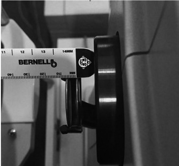
Figure 1. Locations of the two slots for the trial lenses in the Octopus 123 perimeter, with a ruler showing 6 mm distance between them.