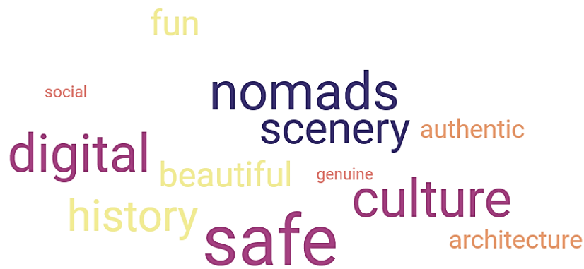
Figure 1: Keywords describing initial perceived image of Portugal.

Portugal has done a great job in the past years through its international promotional campaigns of establishing itself as one of the most popular summer destinations and since 2017 has put more and more effort to bring light into other less known sides of Portugal and promote what it can offer in different seasons too as people tend to associate only summer with Portugal (Oliveira Moreira, 2018). This was showcased also in the results of this study as people also mentioned the good weather.