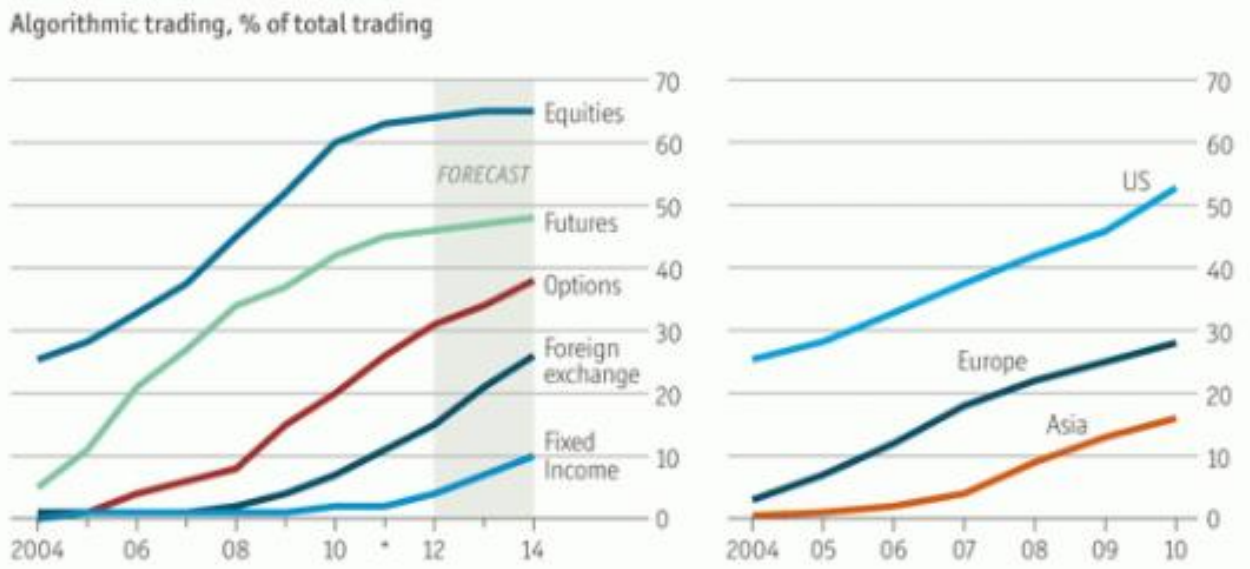
Figure 10 - Rise of High-Frequency Trading.

While the forex market is moving towards a new electronic age, institutions and traders are increasingly turning to software products that help them better manage the market and act without human intervention. This way, they have more time to create really important profitable trading strategies. This automation process still has a long way to go before the software can replace the flexibility of experienced traders. Traders accustomed to the manual system treat automated trading systems with great contempt, who are sceptical about how automated systems work. They protest that the forces of supply and demand in the market are no longer being used in determining prices. Other sections of traders, especially in the derivatives market, suggested that a regulatory framework should be implemented to reduce the risks associated with the malfunction of automated trading systems. (Suliadi, 2019)