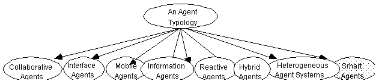
Figure 4 - Types of Artificial Agents.