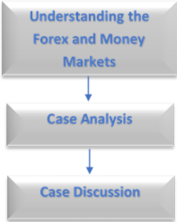
Figure 13 – Methodology design. Prepared by the author

The methodology will follow in the diagram below: