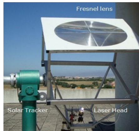
Fig. 1. The Nd:YAG solar-pumped laser system with a 0.9 m diameter Fresnel lens and a laser head positioned in its focal zone.

As shown in Fig. 1, the Nd:YAG solar-pumped laser system is composed of the 0.9 m diameter Fresnel lens mounted on a two-axis solar tracker that follows automatically the sun's movement. The solar tracker is supplied by Shandong Huayi Sunlight Solar Energy Industry Co., Ltd. The Fresnel lens (NTK CF1200) is supplied by Nihon Tokushu Kogaku Jushi Co., Ltd. The Fresnel lens is made of Polymethyl Methacrylate (PMMA) material, which is transparent at visible and near infrared wavelengths, but absorbs the infrared radiation beyond 2200 nm and cut undesirable UV solar radiation below 350 nm. We find that 78.6% of incoming solar radiation is focused to the focal zone about 1.2 m away from the Fresnel lens. In fact, the concentrated solar power at the focal point averaged over 2 min is 445 W for